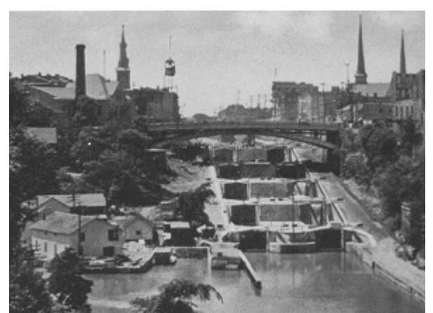
This late 19<sup>th</sup> century photograph of Lockport shows the five locks William Clayton mentioned in his journal.

I must confess I was delighted to see the superior neatness and tasty state of the buildings. Many painted white, others brick and some have the doors painted yellow. We bought some large red apples for a cent each which was truly delicious. The streets are wide but not so well flagged and paved as they are in England.